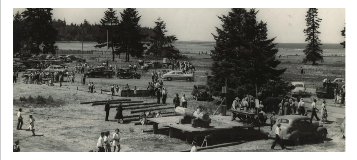
Logger sports - Parksville Community Park (circa 1940)