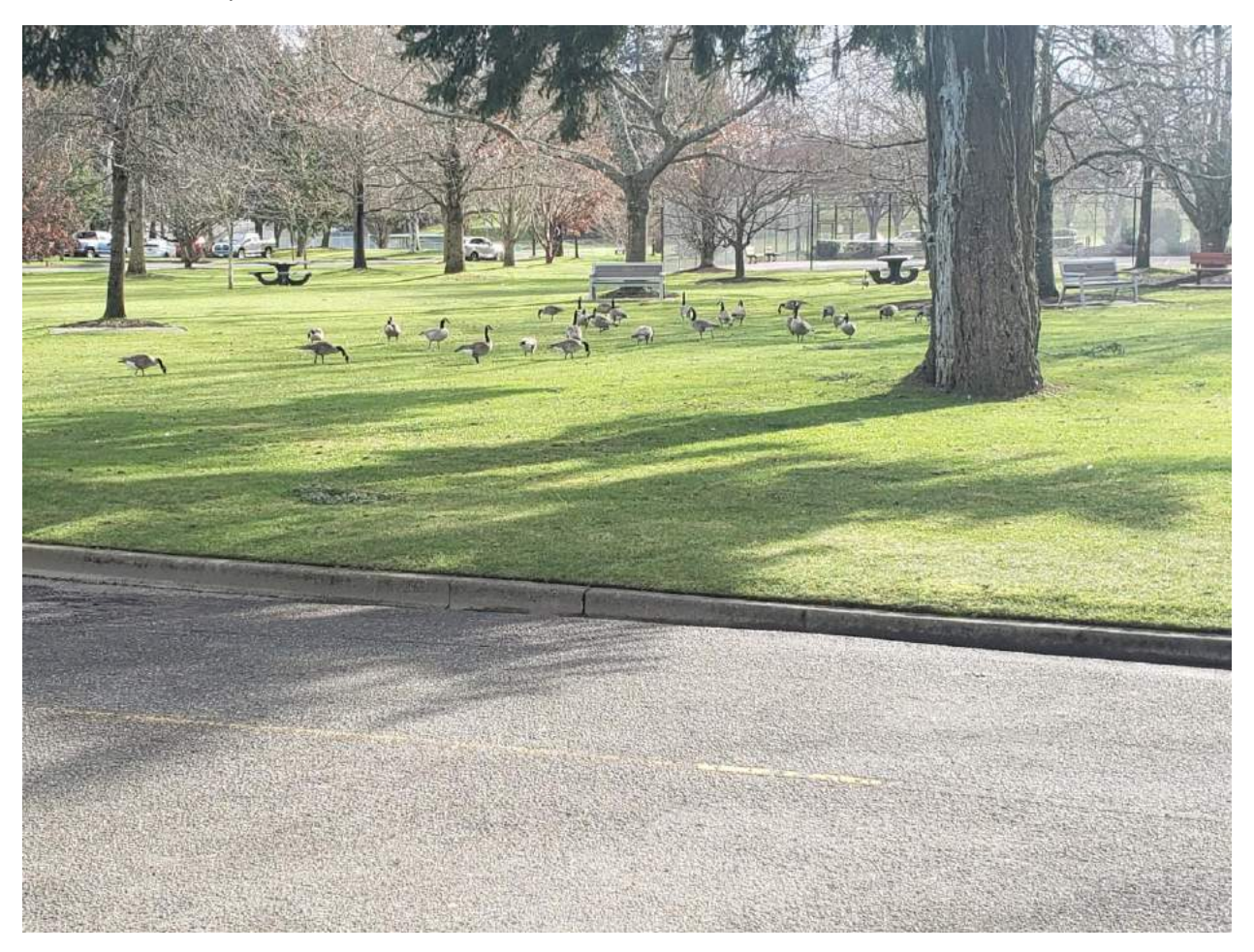
Photo 1: a gaggle of Canada Geese graze in Parksville Community Park.

During the survey 817 Canada Geese were observed from approximately Lantzville to Qualicum Bay during the count. This number is number was an increase from last year's count which tallied at 476. The annual average of CAGO winter counts since 2012 is now 1032.5. Our 2022 addling data shows that nesting numbers are once again on the rise in the Englishman River estuary. In 2016 there were 72 active nests in ERE after our initial First Nations led adult CAGO harvest which specifically targeted the ERE nesting population, the number of nests fell to 26. In the several years following the number was reduced to 18 nests due to annual addling. However in the last two years the nesting numbers have been climbing again, collar-tag data shows that this is primarily from maturing birds from Nanaimo moving into the newly available habitat freed up by mitigation efforts. A 2023 harvest will be needed in Parksville to fully address the rising trend in nesting and GooSE will be recommending to the City of Nanaimo that they host a harvest in the 2023 as well.