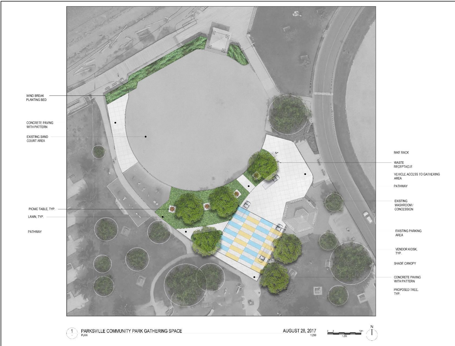
Figure 2: Community Gathering Space Concept